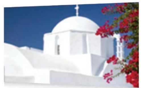
VPL-HW45ES & VPL-HW65ES

Conventional Home Cinema projectors sacrifice some colour accuracy by increasing greens to improve brightness. With Bright Cinema and Bright TV modes, the VPL-HW45ES & VPL-HW65ES retain true colour and contrast, even in a bright environment.