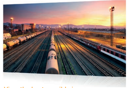
View the best possible images

Developed for our leading 4K Home Cinema projector range, our next generation Reality Creation reproduces colours and textures that are lost when movies are packaged to disc. It gives you crisper, sharper Full HD pictures, much closer to the 1080p original, for even better upscaling.