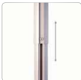
Perfect adjustment with telescopic feature